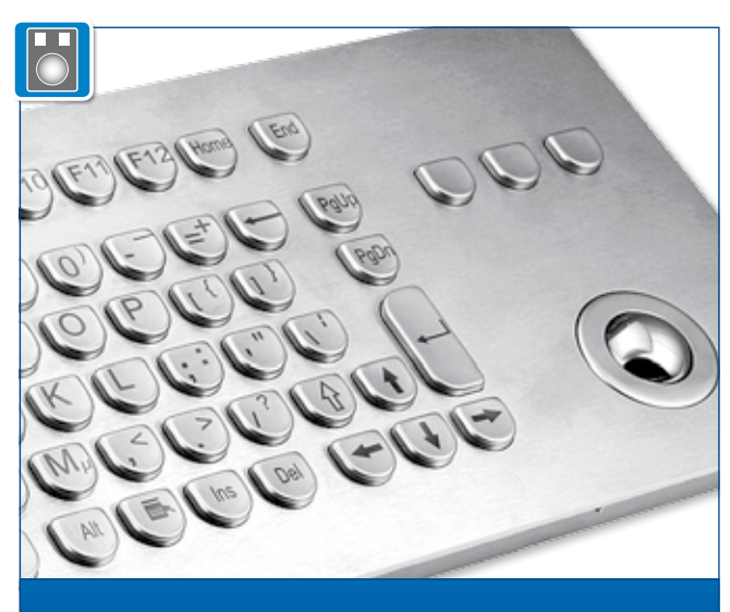
TKV-084-TB25V-MODUL with integrated 25-mm-trackball

Switching Technology: Carbon Ccontact Technology Switching Force: 1.0 N Switch Travel: 1.5 mm Switching Cycles: Approx. 10 Mio. (per key) Housing Design: Front Panel with Threaded Bolts Front panel material: Stainless Steel Operating Temperature: -25 °C to + 70 °C 1 Storage Temperature: -25 °C to +80 °C PS/2; USB Interface: