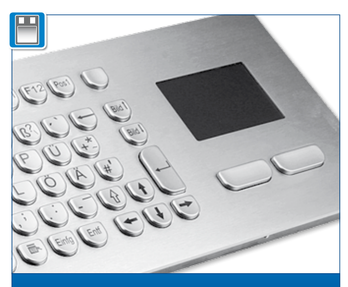
TKV-084-TOUCH-MODUL with integrated touchpad