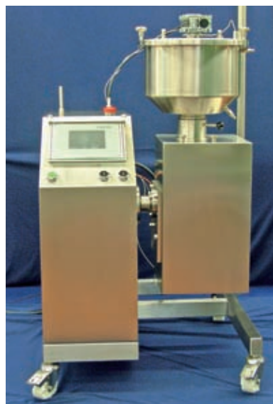
MP blenders from Somakon can be adapted to the requirements of the customer