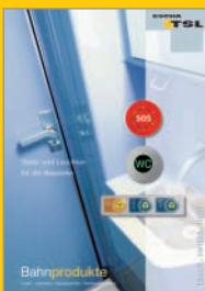
Level monitoring/Wet rooms

ESCHA TSL GmbH Elberfelder Str. 1 . 58553 Halver . Germany Sales: Phone: +49 2353 66796-0 . Fax: +49 2353 66796-99 info@escha-tsl.de . www.escha-tsl.com