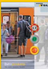
Train products for the door area

ESCHA TSL GmbH Elberfelder Str. 1 . 58553 Halver . Germany Sales: Phone: +49 2353 66796-0 . Fax: +49 2353 66796-99 info@escha-tsl.de . www.escha-tsl.com