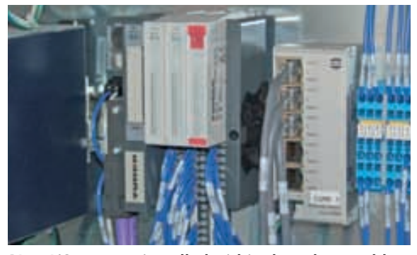
BL20 I/O systems installed within the subassembly give users control and diagnostics on the machine