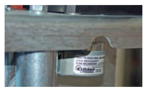
A custom-built encoder with a d-sub connector was designed for Pro Pack's new machine

erected, providing a higher resolution image. Pro Pack realized that printing inside the machine also saves additional floor space required for traditional post-pack printing that may also include bump-turn methods and extra hardware cost.