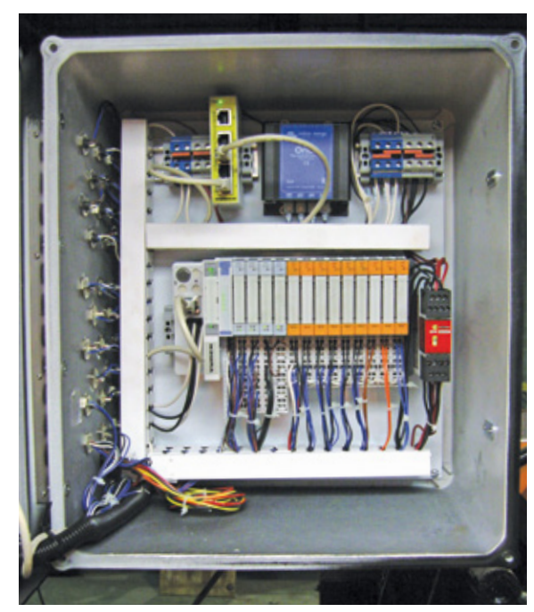
Turck's BL20 I/O system with Ethernet switch simplifies assembly and startup on site