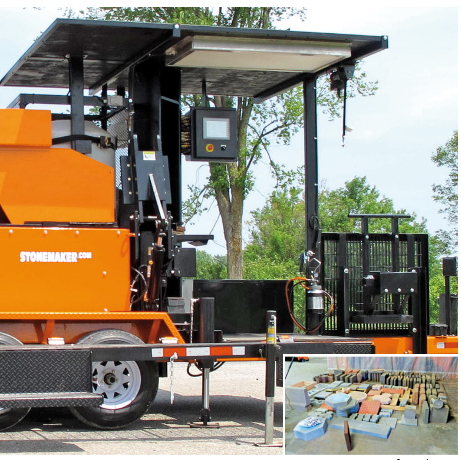
table stone making factory, has the ability to single handedly build a city; from the foundation building blocks all the way to the roof tiles.