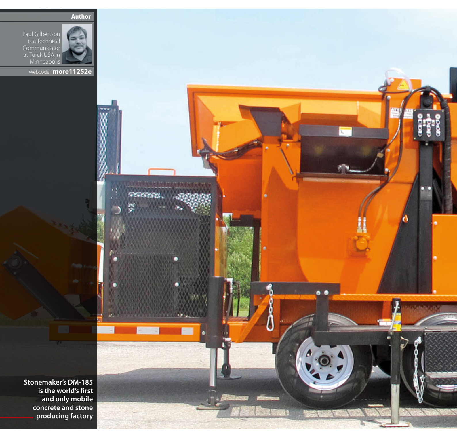
User www.stonemaker.com Integrators www.internationalhydraulics.com www.hilco-inc.com