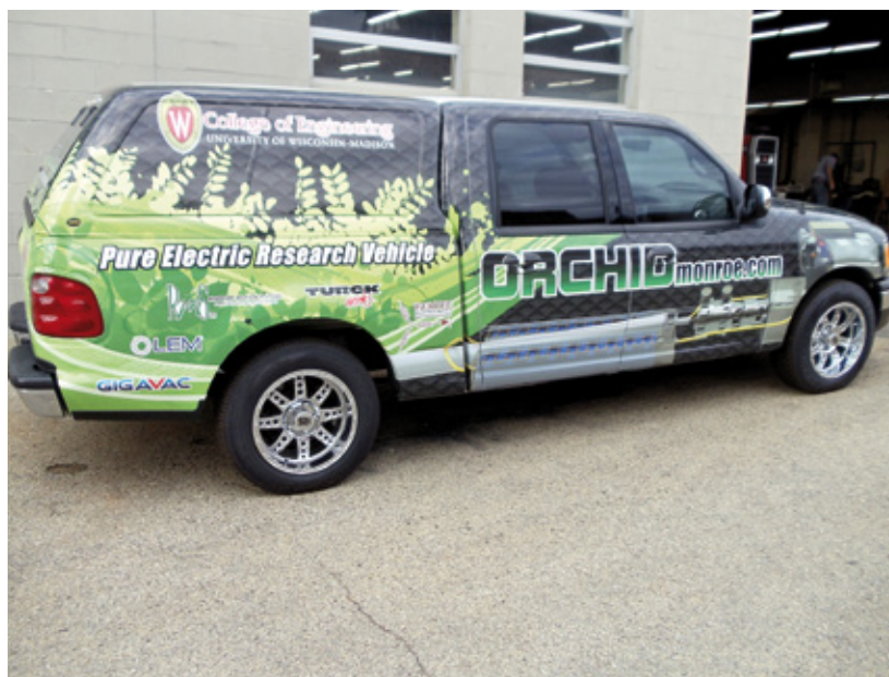
Research vehicle: With support from Orchid and Turck Phillip Kollmeyer developed an Electric Ford F150

Kollmeyer has taken full advantage of this feature to minimize the hours needed to complete the project. He explained the benefits as follows: "Many of the connections in our research vehicle are sensitive signal level cables, requiring shielded cabling. If I had to build